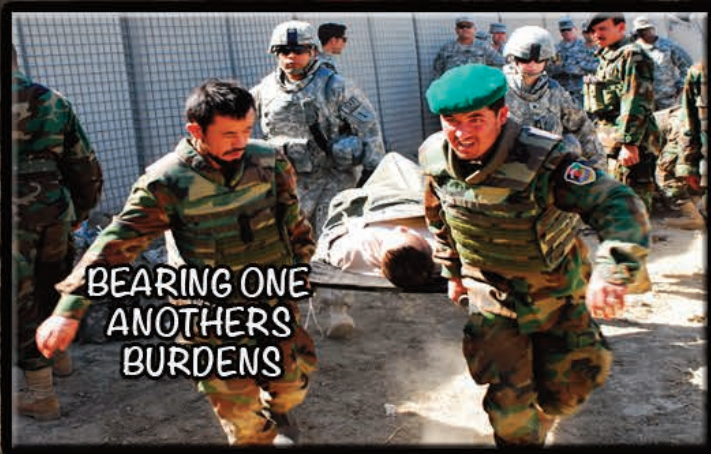
BEARING ONE ANOTHER'S BURDENS