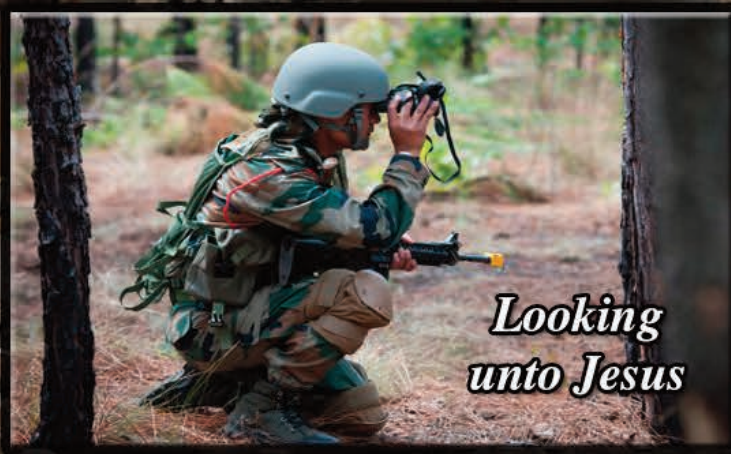
Looking unto Jesus