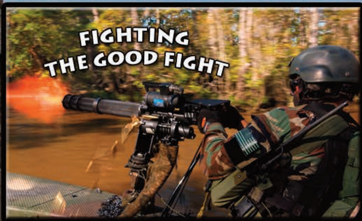
FIGHTING THE GOOD FIGHT

FOR THE WEAPONS OF OUR WARFARE ARE NOT CARNAL BUT MIGHTY THROUGH GOD TO THE PULLING DOWN OF STRONGHOLDS