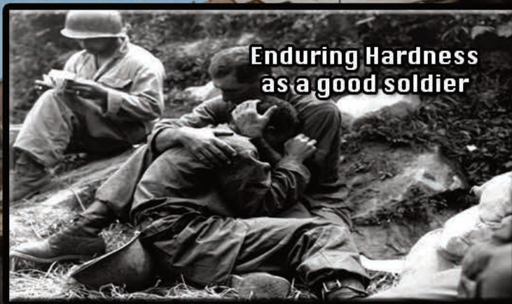
Enduring Hardness as a good soldier